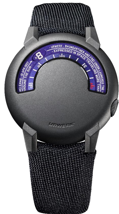
01:48 pm ; hot lunch break in old-town