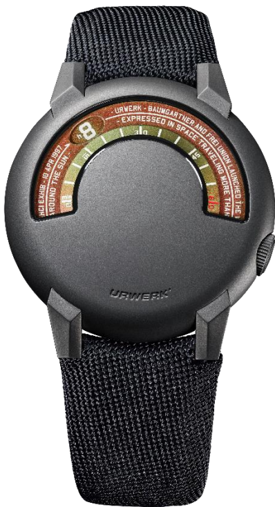
8:25 am ; fresh morning walk by the lake

Engaged in a process of perpetual renewal, the Jacoby and URWERK creation marries the systemic precision of chronometry with the harmony of human biology.