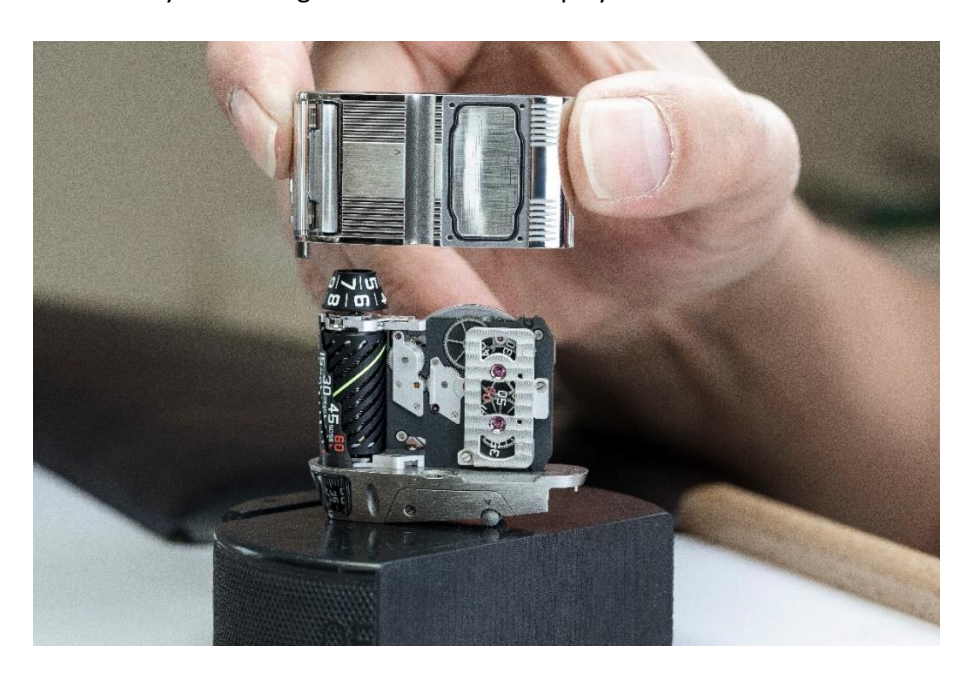
The UR-111C, an exceptional timepiece to be indulged in

The various finishes of the case are worthy of note — a harmonious combination of surface textures that have been sanded, shot-blasted, polished or satin finished. A simple screw can be finished in a number of different ways according to the surface on display.