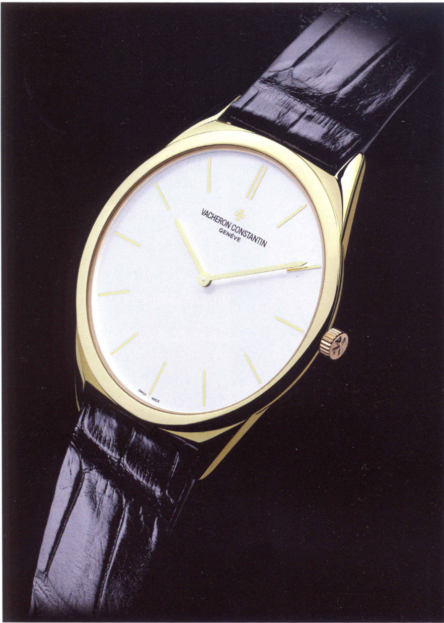
Vacheron Constantin Historique Ultra-fine 1955 – the world's thinnest mechanical hand-wound watch